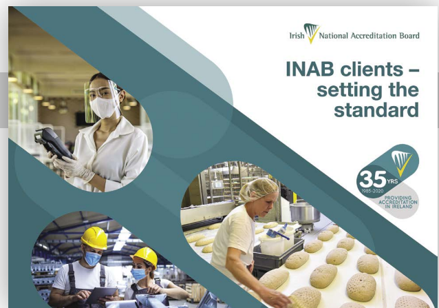
INABs new brochure to mark our 35th

Additionally certification bodies are issuing accredited certificate for management systems such as quality (ISO