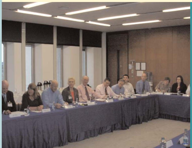
Assessor Forum – 22nd and 29th January 2008

Overall the event was very successful, with plenty of discussion and feedback.