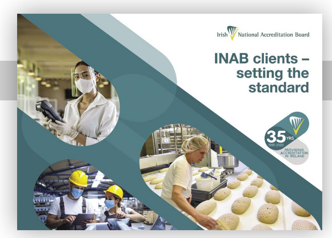
INABs new brochure to mark our 35th

Additionally certification bodies are issuing accredited certificate for management systems such as quality (ISO